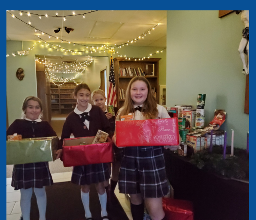
Light of Christ Academy held a food drive for Bread of Life.