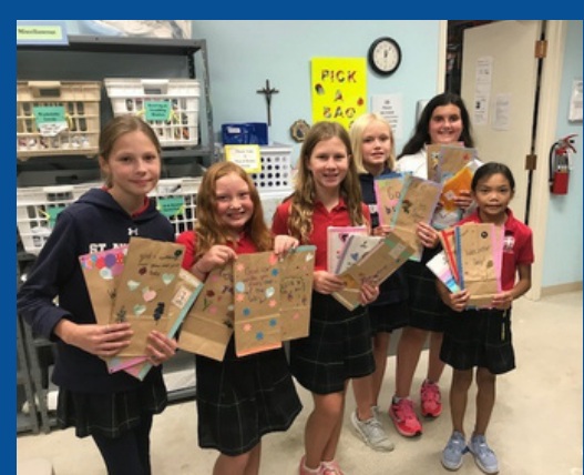
St. Augustine students volunteer regularly at Caring Network and help with donation drives.

Celebrate Catholic Schools Week January 28 through February 3, 2024