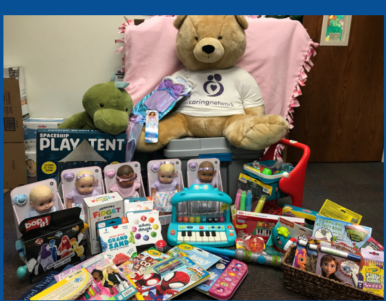
St. Monica students raised money to purchase Christmas gifts for Caring Network families.